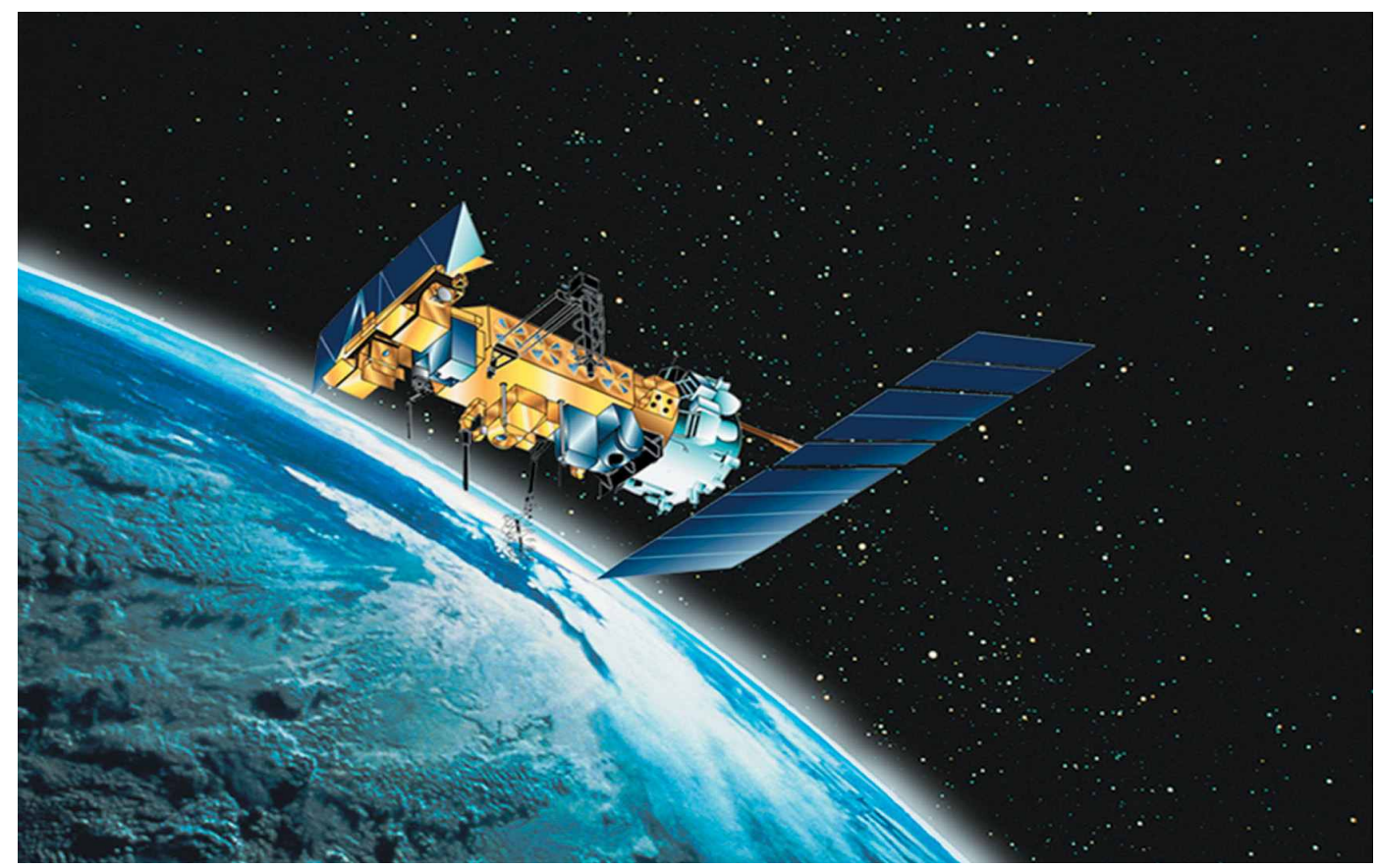
NOAA-18, the newest in a long line of weather and environmental satellites, launched May 20, 2005.

This article was provided by the Jet Propulsion Laboratory, California Institute of Technology, under a contract with the National Aeronautics and Space Administration.