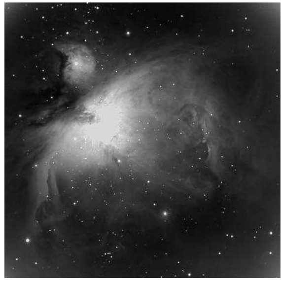
M42 Taken by Gary Hug with the 16" Meade and the new STL1001E SBIG Camera.