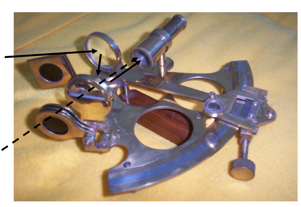
Figure 2, the optical paths in a sextant.

The horizon, seen through unsilvered part of second mirror